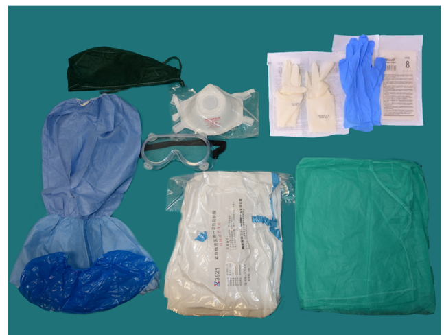
Fig. 3 Personal protective equipment (PPE) used for a COVID-19 postmortem examination. Head cover, shoes cover, leg cover, Tyvek chemical protection coverall (Cat. III), impermeable gown, plastic protective goggles, 3 pairs of surgical sterile gloves, 1 pair of powder-free nitrile gloves, FFP3 protective face mask