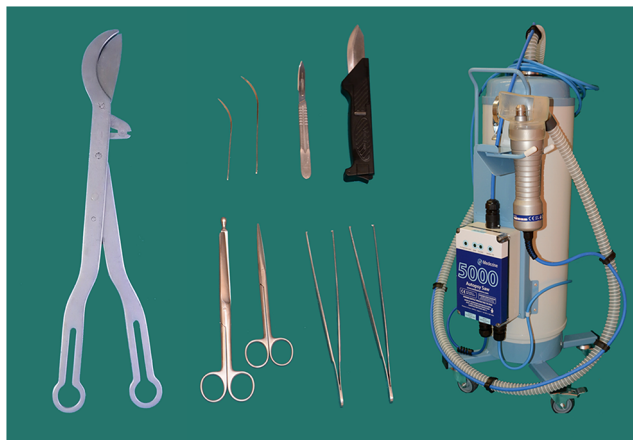
Fig. 2 Essential instruments available in the autopsy suite for a COVID-19 postmortem examination

fixed in 10% formalin solution with a final formaldehyde concentration of 4%. Paraformaldehyde-glutaraldehyde solution (Karnovsky's fixative) was used for electron microscopic analysis and RNA stabilization solution (RNA later) for molecular analysis. Distinct test tubes filled with Karnovsky's fixative and RNA later (recognizable based on shape or cap's color) were used for the specific organ/tissue samples (Fig. 1). This allowed performing the first disinfection of each tubes without jeopardizing correct sample identification. One endobronchial swab and fragments of lung tissue placed in saline phosphate buffer were systematically sent the Microbiology and Virology Unit, Padua University Hospital, Padua, Italy, for molecular and cultural analysis. Lungs, heart, liver, kidney, spleen, and brain were removed and placed in formalin within rigid plastic containers. All procedures were recorded on digital devices.